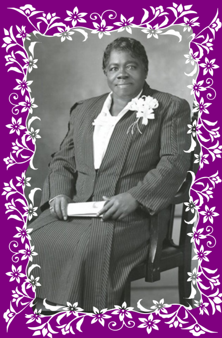
Mary McLeod Bethune

This year, the theme is Celebrating Women Who Advocate for Equity, Diversity, and Inclusion , which recognizes women who “understand that, for a positive future, we need to eliminate bias and discrimination entirely from our lives and institutions.”